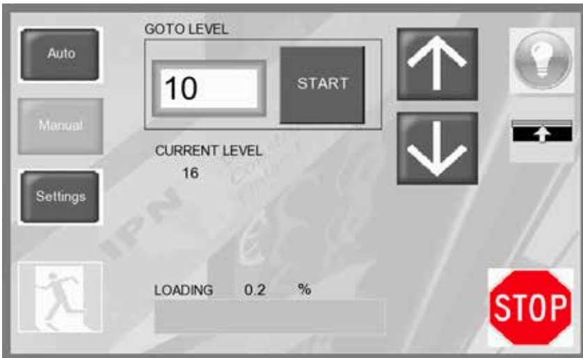
More user friendly functionality