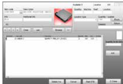
Pac-Light easily integrates with TC2000 article management software