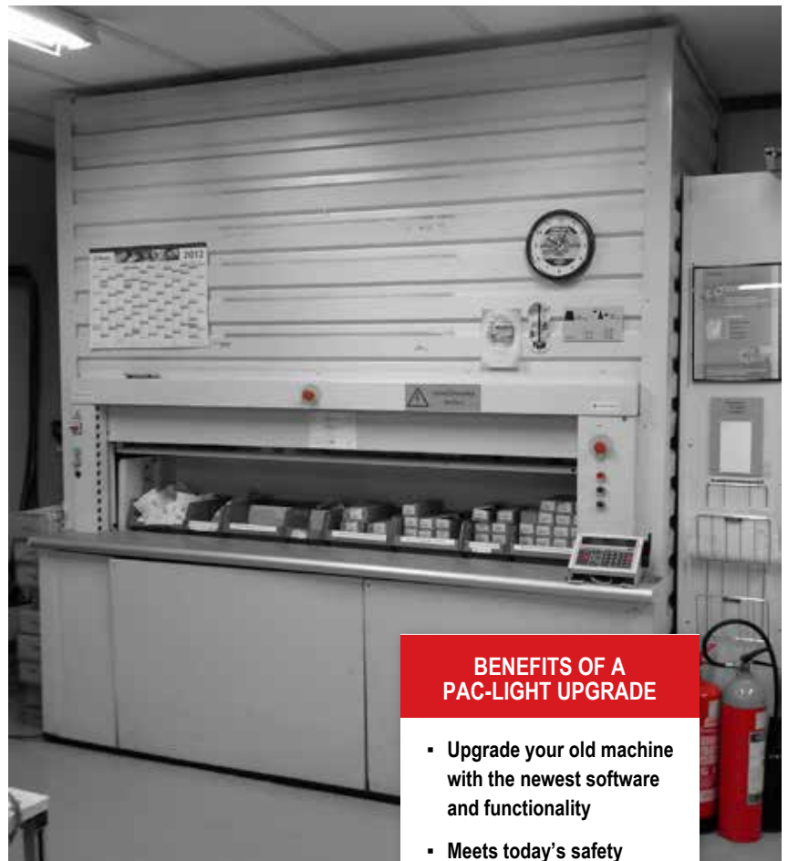
Existing Paternoster suitable for a PaC-Light upgrade

Installation of the PaC-Light control package normally takes one workday, so the daily operations at the Paternoster are not interrupted for a long period.